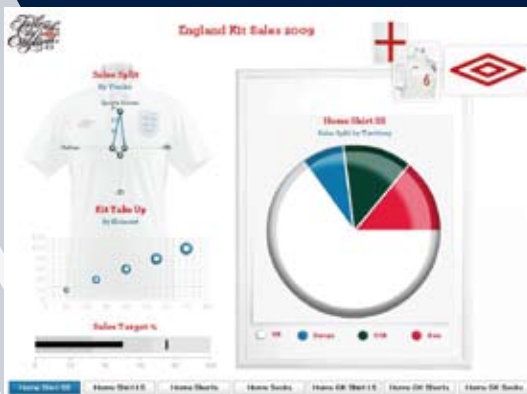
<< >> Sample Reports