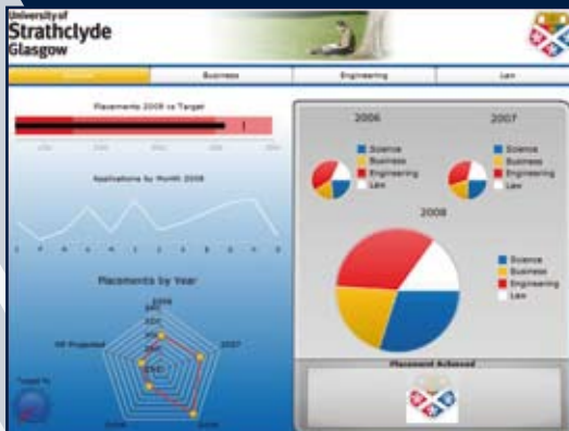
<< >> Sample Dashboards