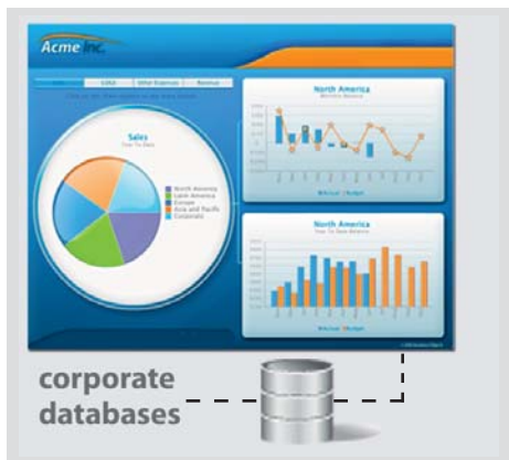
Figure 1: Sample Visual Model of Corporate Data

Xcelsius® Engage software allows you to create interactive dashboards from spreadsheets and live corporate data. It helps you predict future performance; save costs, time, and resources; extend the reach of your IT solutions; and maximize the value of your IT investments.